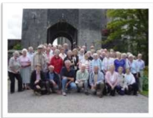
Members and friends of Thatcham Historical Society arriving at Penrhyn Castle, 2006.