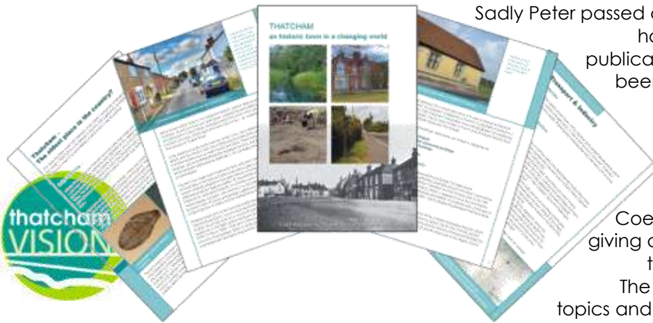
Pages from the publication which was jointly published with Thatcham Vision.